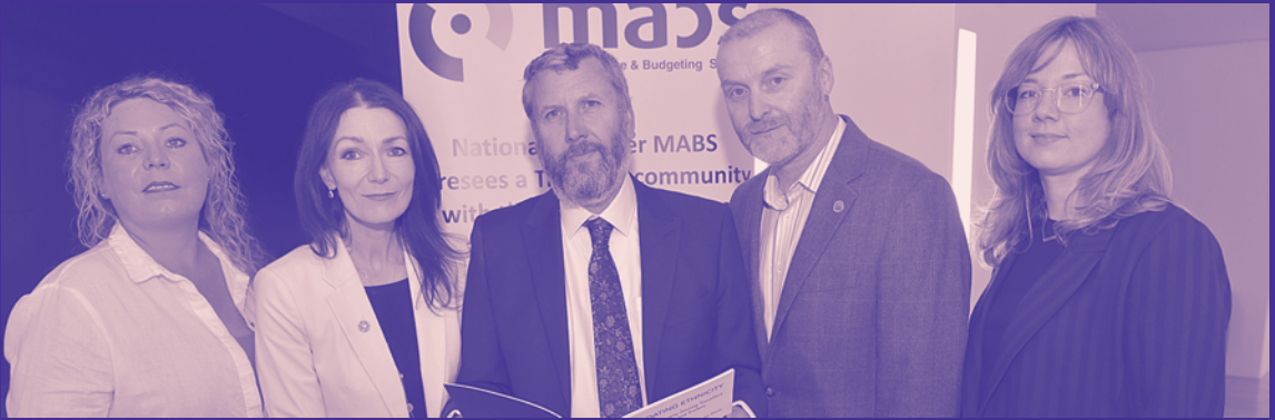
Launch of Report into Energy Poverty Among Travellers Living in Mobile Homes and Trailers