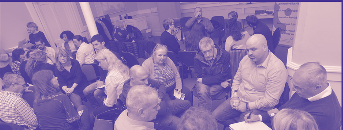
Travellers in Prison Networking Event in Carmichael House on November 26th 2019.