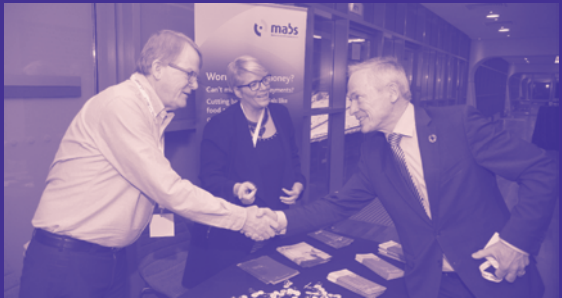
Energy Action Conference with Minister Richard Bruton