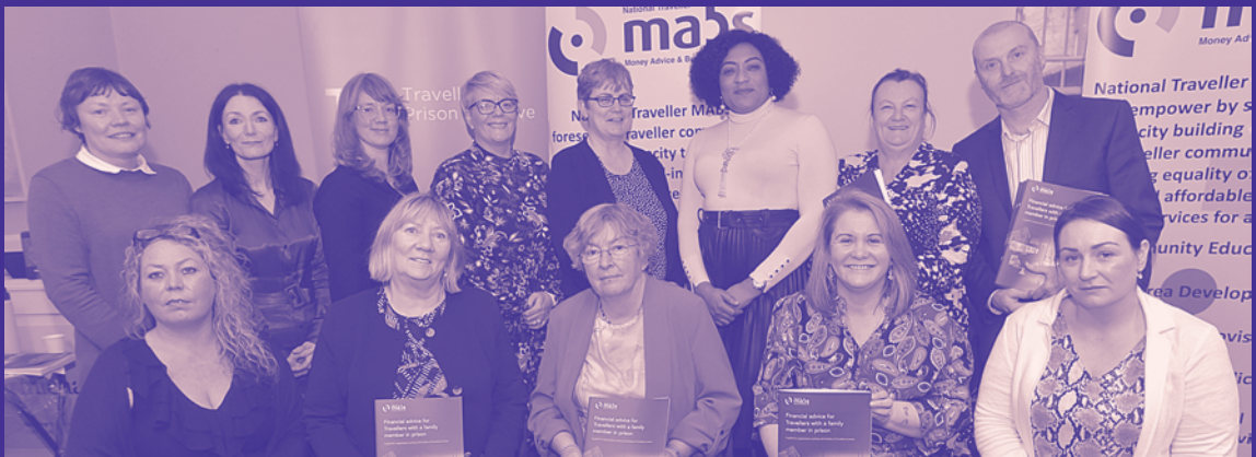
Staff and board of National Traveller MABS and Citizens Information Board at the launch of the guidebook Financial advice for Travellers with a family member in prison