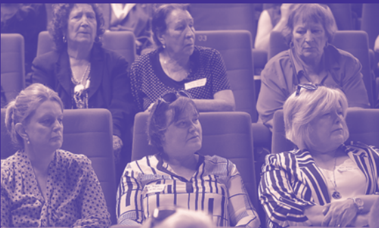
Launch of Report into Energy Poverty Among Travellers Living in Mobile Homes and Trailers